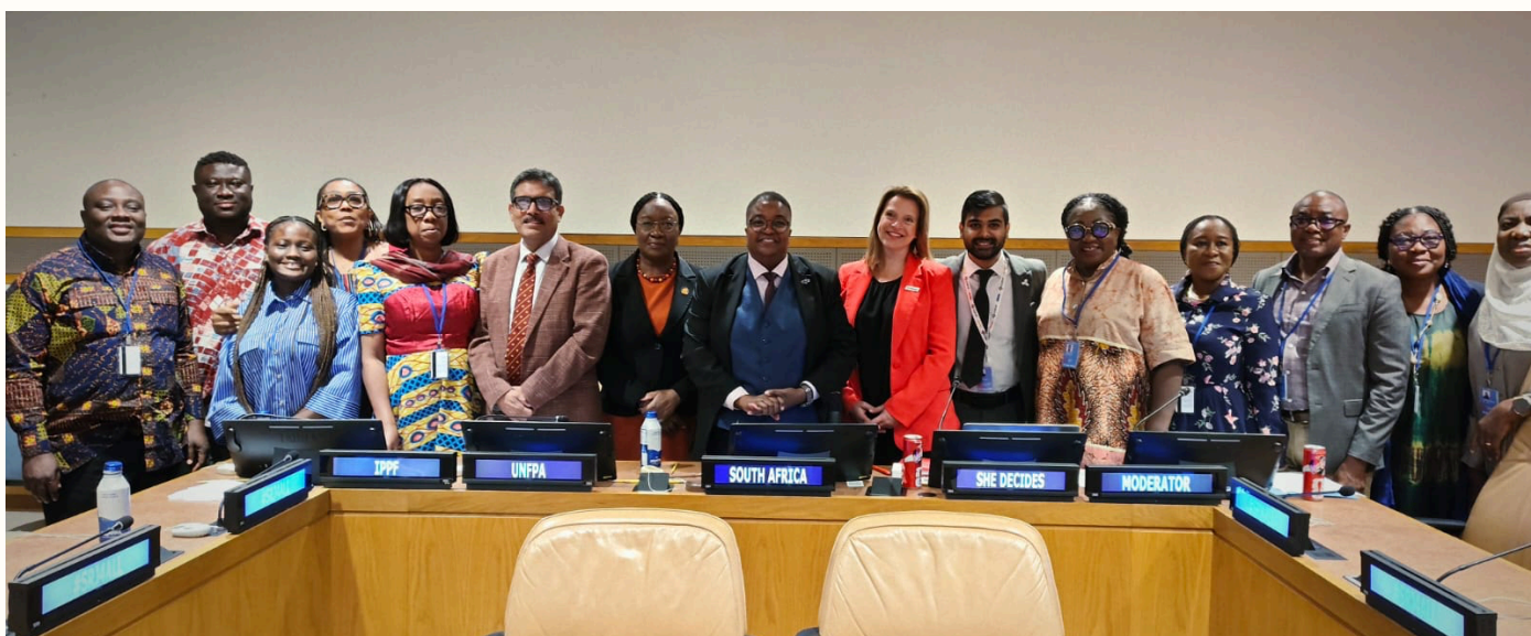
Pictured above is the same as below including High level national government delegation of Ghana comprising representatives of the National planning commission of Ghana and honorable members of the parliament of Ghana population and development caucus and civil society

Given that South Africa as a co-signatory to the ICPD, and further having passed the National SRJ strategy in February this year the country is taking a clear stance of support for SRHR. This moment is the time for, civil society to celebrate and realise these wins, advancing them and building stronger organisation to counter efforts of anti-rights actors. Indeed, now more than ever we must remember the shocks of policy failures do not confine themselves to conference rooms, as Levi puts it, people absorb the cost.