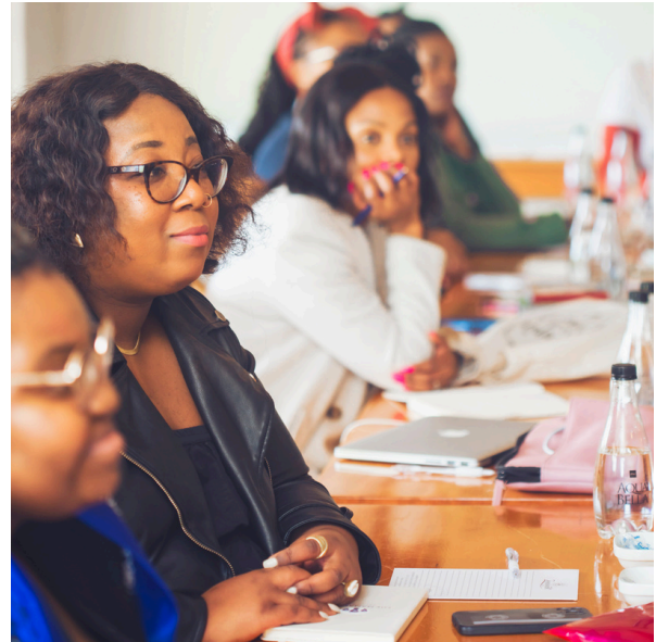
Mamandla Fellows during their graduation weekend at Mont Fleur

Embrace marked a major milestone with the graduation of their fifth cohort of Mamandla Fellows. The weekend-long event, held at Mont Fleur in Stellenbosch, closed a year of deep learning, leadership development, and connection. Graduates entered the Mamandla Alumni Network equipped to amplify their advocacy and transform their communities.