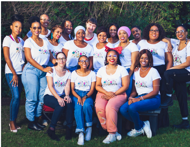
Mamandla Fellows during their graduation weekend at Mont Fleur

In addition to the graduation, Embrace launched new Embrace Network nodes in Gqeberha, Umtata, East London, and Knysna, bringing together 118 individuals and grassroots organisations working toward maternal justice and social equity.